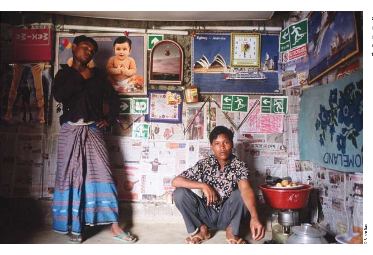
Child workers coming from outside chittagong share basic rooms rented nearby the yards.

fellow workers, we all have nightmare, we talk during our sleep. The cutter whom I share the room with continues to give order during his sleep."